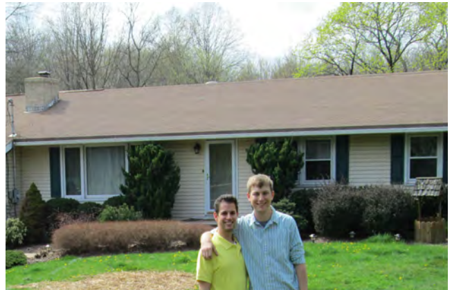
Photo taken on the day we closed on our house in 2013

In the summer, we love spending time in our pool, playing games outside with our friends, and watching hot air balloons from our front yard!