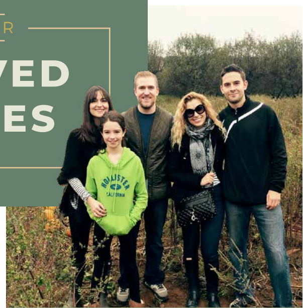
PUMPKIN PICKING WITH FAMILY