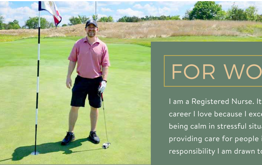
ENJOYING A ROUND OF GOLF

I enjoy music and I used to DJ part-time while putting myself through nursing school.