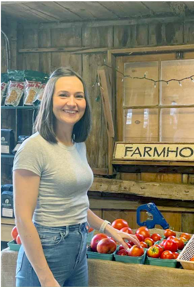
CHECKING OUT OUR LOCAL FARMERS' MARKET