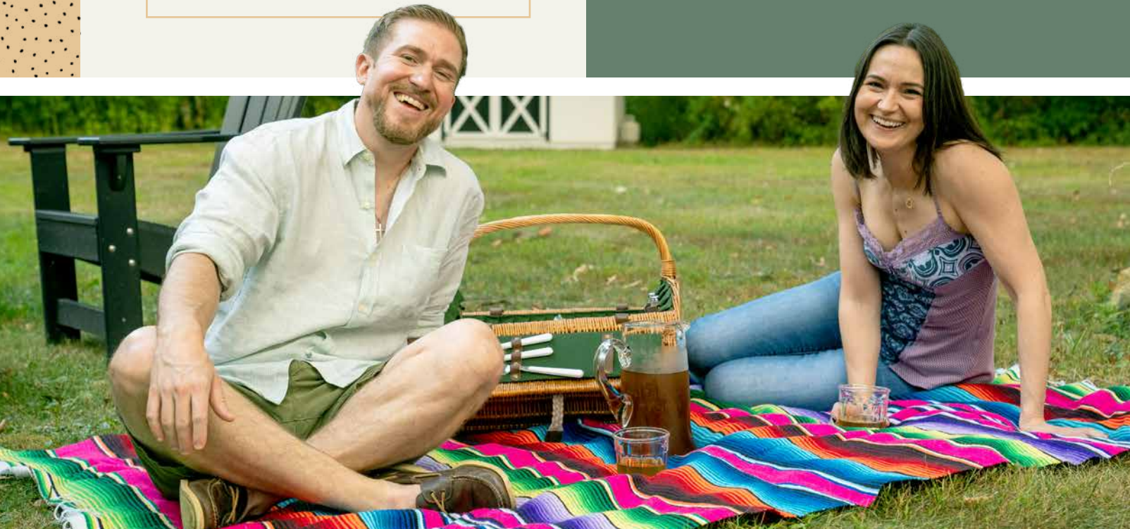
ENJOYING A PICNIC IN OUR BACKYARD

We are blessed to live in a beautiful suburb in New Jersey with a deep sense of community and one of the top school systems in the country!