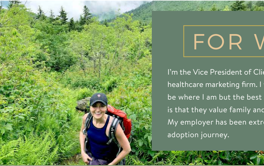
HIKING IN NORTH CAROLINA

I'm the Vice President of Client Engagement for a healthcare marketing firm. I worked incredibly hard to be where I am but the best part about my employer is that they value family and insist we put it first. My employer has been extremely supportive of our adoption journey.