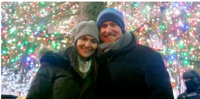
WEEKEND TRIP TO NEW YORK CITY