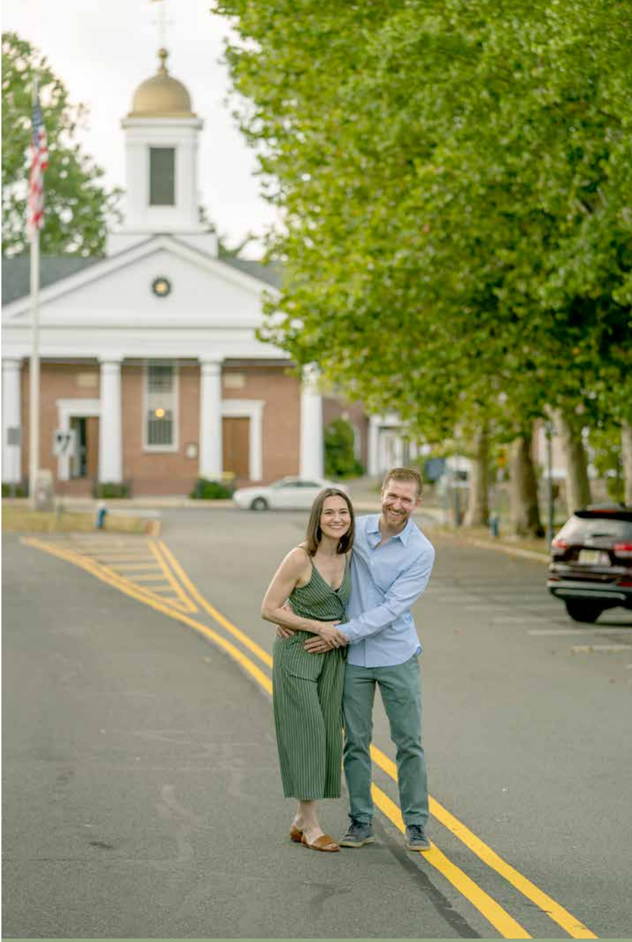
TAKING AN EVENING STROLL IN TOWN